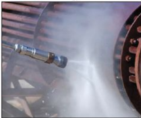
Safe and effective surface preparation.

The BC-H9-C and BC-H9LF-C can handle pressures from 28k-40k psi. Both of these models feature 4 jets with speed control rotation. The BC-H9-C is for 4-8 gpm and the BC-H9LF-C is for 3-4 gpm.