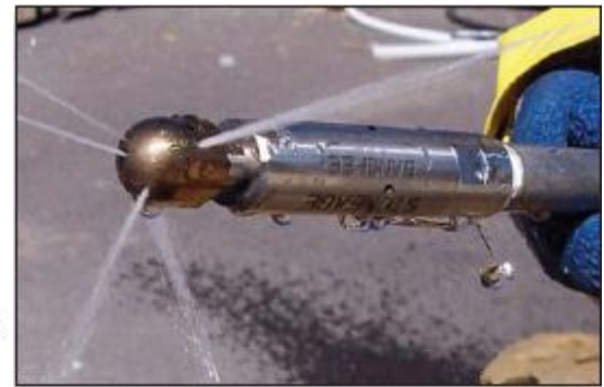
A Banshee® BN24.™

The Banshee ® represents our latest engineering achievement for cleaning small tubes. These tools provide the highest quality jets with no replacement parts. Customer feedback on these new tools has been outstanding worldwide.