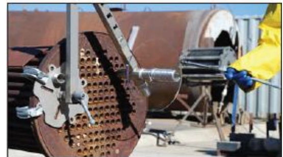
Banshee® enters tube bundle with VE 70000 .